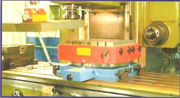
1. Loading workpiece.