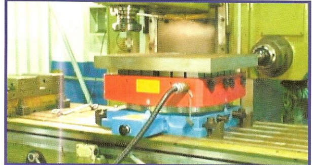
2. Connect the electric cable to the chuck.