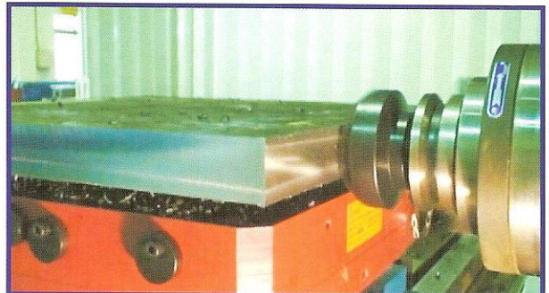
6. Side machining.