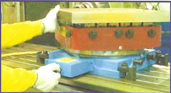
7. Rotate angle and keep to machining.