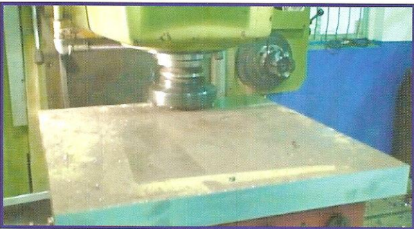
5. Surface machining.